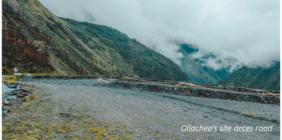
Ollachea's site access road

We anticipate that these due diligence reviews will continue through the end of the year and into 2022. Although there can be no assurance that these parties will continue to be interested once they complete their due diligence reviews, we hope to receive initial non-binding indicative proposals during the first quarter of 2022.